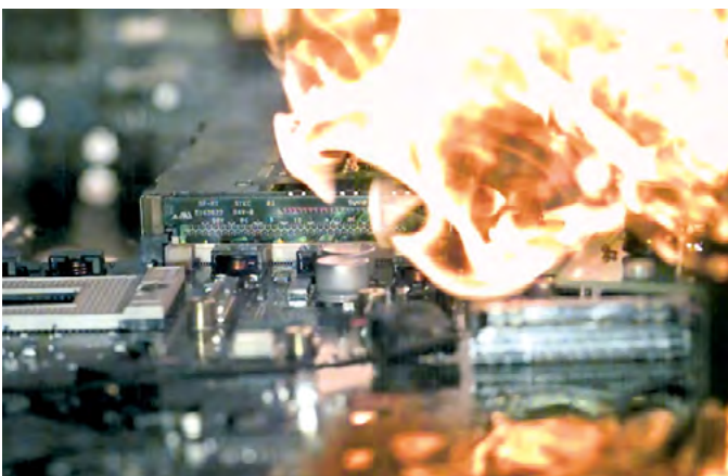
Fire starts due to electronic failure

Helios Systems E-Bulb is filled with 3M™ Novec™ Engineered Fluid. This non-toxic, non-conductive extinguishing liquid is released into the device when the defined temperature is reached and the Thermo-Bulb bursts. After being initiated, the E-Bulb extinguishes the fire, and interrupts the electric current. Transition-free, the liquid immediately converts into gas. As a result of cooling and (partly) by oxygen reduction, a fire on a PCB will be extinguished within seconds. And, because the current flow over the E-Bulb is interrupted, the electric fire cannot re-ignite.