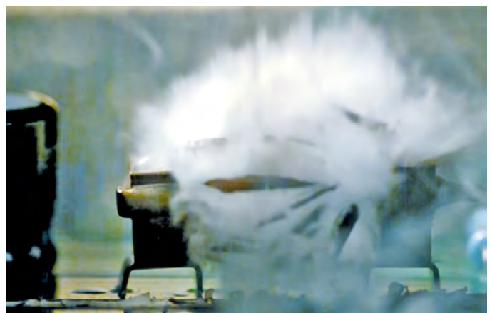
E-Bulb automatically detects and extinguishes the fire.